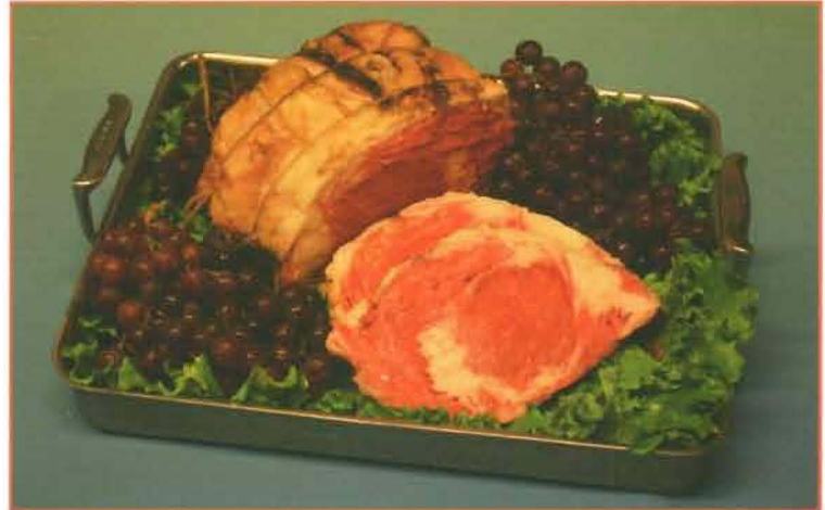
Rib Roast Dinner