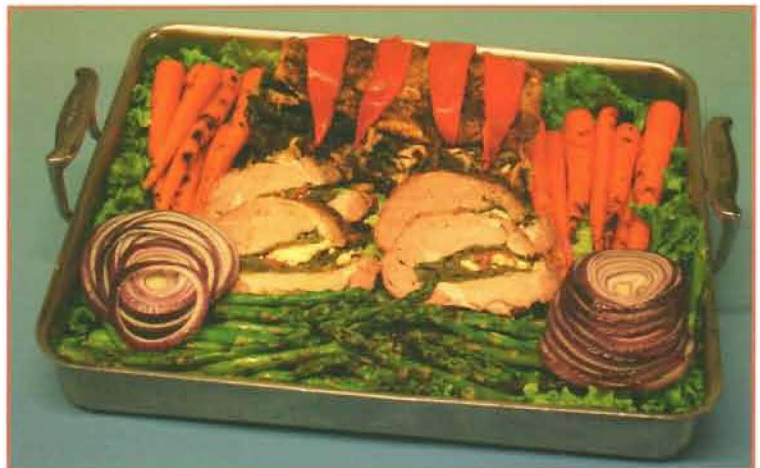
Stuffed Pork Roast Dinner