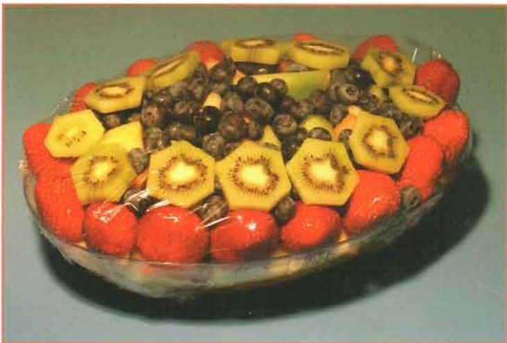
Luau Fruit Bowl